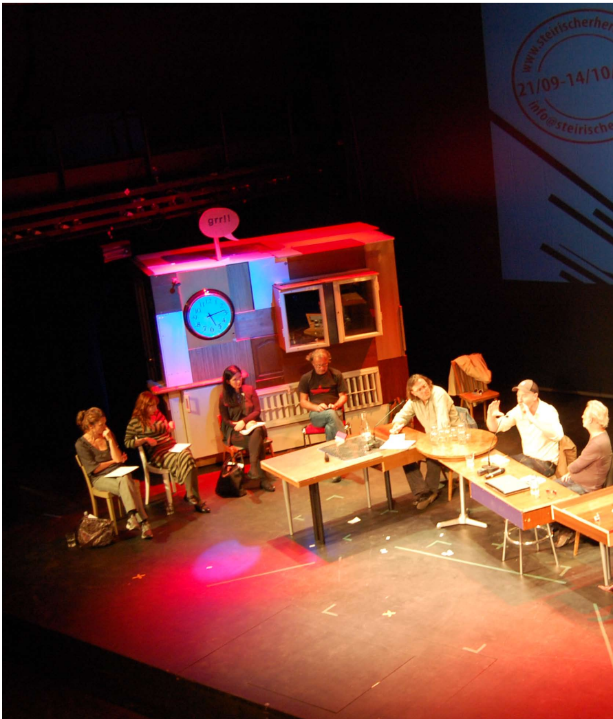
Black cube stage