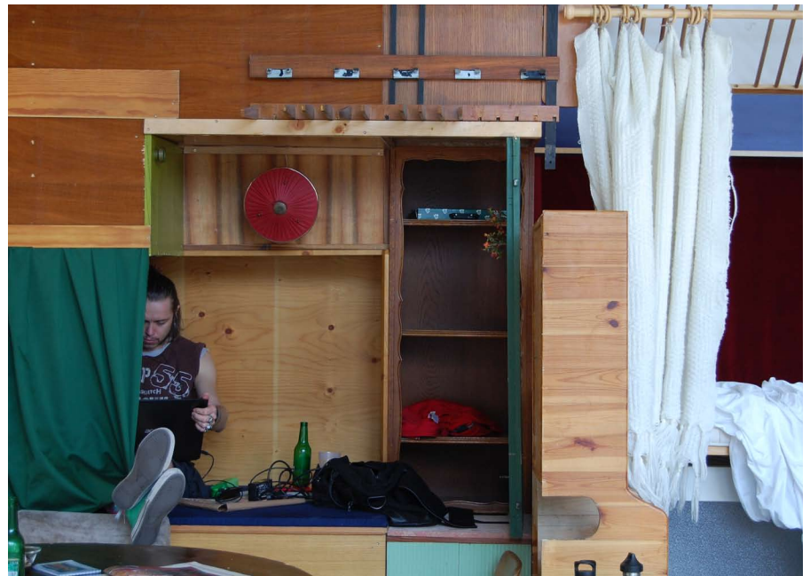
Furniture collage in the main space of the festival

Building in an age in which the Holocene era has long since given way to the man-made Anthropocene era, when the sediments of the waste products of civilisation by far exceed those of nature, means building with materials that do not need to be newly produced. With material intended for recycling, or with things that have reached the end of their useful lifecycle. But building a camp for this steirischer herbst also means building for artists, activists, theorists, for visitors, for the city of Graz, for its inhabitants. Building for content, building for the 24/7 enjoyment of being there, giving and taking, discussing, thinking for yourself, learning something new, having a different opinion, having a place where you can be left alone for a while, so as to be able to carry on watching, listening, singing along, getting tired, fighting it. Get a breath of air, go back in, take a break, moan about everything, grab a bite to eat, go to bed. The idea is to give the marathon camp a flexible form, linking the two buildings, the Thalia and Opernring 7, creating a landscape that wants to be used. Not a turn-key facility handed over when the festival begins, but one that is constantly changing during the course of the marathon camp. And which will afterwards proudly sport the scars of a bustling week of living and working.