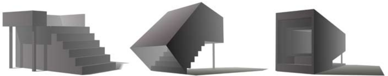
The original three designs proposed, BALCONY, SIP and SCREEN

The design for the Info Point for Periferic Biennial originally suggests three structures to be placed in public space in the city of Iasi, Romania.